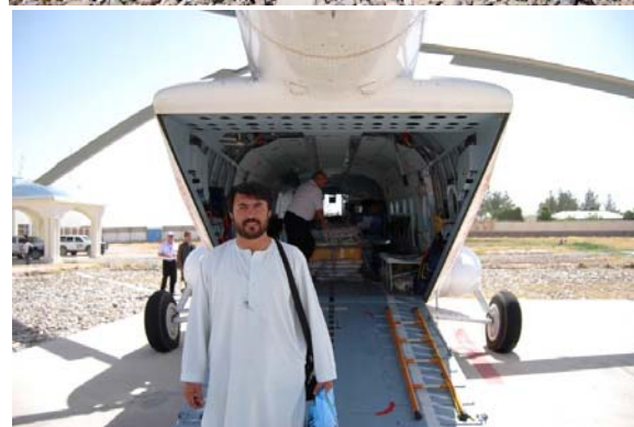
A UN chopper delivers election materials in Trinkot, Uruzgan Province (Photos, courtesy of Yury Ozerov: July 2009)

centres/stations is/will be a tremendously challenging logistical undertaking which will push IEC's capacity to the limit.