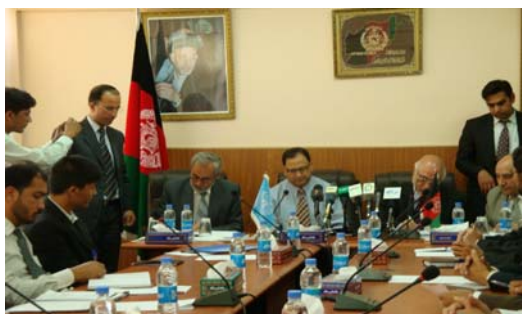
Signing Ceremony of New Justice & Human Rights Project

K abul, 19 July 2009 -- Following continuous engagement in supporting Afghanistan's justice sector since 2002, UNDP Afghanistan's support to the sector has entered a new phase. The two former UNDP justice projects – Strengthening the Justice System of Afghanistan (SJSA) and Access to Justice at the District Level (AJDL) have been consolidated into one new project titled Justice and Human Rights in Afghanistan Project (JHRA). The JHRA project document was signed on Sunday 19 July 2009 between UNDP and the three state justice institutions: the Supreme Court, Ministry of Justice and the Attorney-General