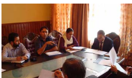
Group discussion between MPs and SEAL team

A handbook for Members of National Assembly has been designed by SEAL with the assistance and inputs from the secretariat of Wolesi Jirga (Lower House) and Meshrano Jirga (the Senate). The draft was presented to the Secretaries-General of Wolesi Jirga and Meshrano Jirga.