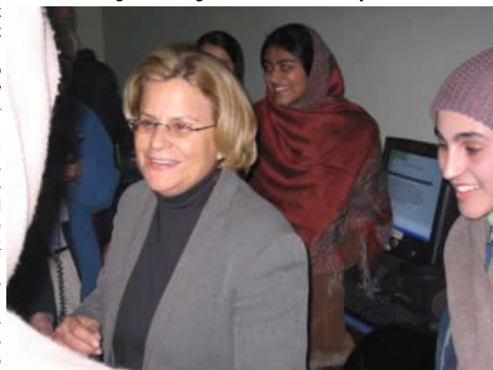
Congresswoman Ileana Ros-Lehtinen chatting with Cisco students

International Telecommunication Union, the Cisco Networking Academy Program in Afghanistan is hosted by Kabul