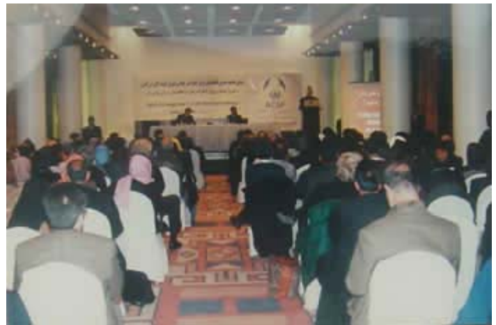
Civil Society representatives listening to President Karzai

Included among the participating organizations