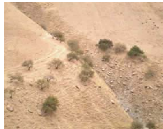
Desertification: This is what is to be stopped and overturned

project will be the production of “National Land Degradation Hazard Map” that will show not only types and geographical coverage of physical impoverishment but also the scale on which it is taking place. The National Map will be subdivided by watersheds, biogeographical areas and ultimately into manageable land units.