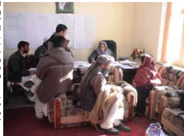
Philosophical discussions on gender and religious issues

ter, could their lives have been made better?" were some of the questions that the participants found themselves against. One immediate and tangible result of the workshop was the purchase by one male participant of a pair of gloves for his daughter alongside a resolution for greater husband-wife cooperation in household chores (e.g., by helping in turning on wood stove.)